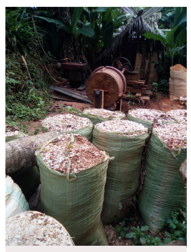
Crushed minerals, Mawamba gold mining site, Mambasa territory, Ituri

Since 2010, artisanal miners in DRC are obliged to group themselves in mining cooperatives.<sup>106</sup> Ever since, such cooperatives have mushroomed all over the eastern part of the country. Unfortunately, instead of promoting collective action among artisanal miners to further their interests, in practice, cooperatives have become vehicles to exploit the miners. Cooperatives are subject to elite capture, they establish trade monopolies, are organized along ethnic lines, and they do not provide any support to miners. This rather increases socio-economic inequality and frustrations, and could potentially increase community tensions over access to resources.<sup>107</sup> In February 2022, two people got killed following a dispute between members of two different clans in the groupement Bamuguba Sud (South Kivu province), notably the Lwito and Milambwe. The two clans competed for the management of the cooperative that oversaw the cassiterite mining site of Ndilo. Local authorities seem to have made an uncareful assessment when deciding to create a cooperative to exploit the Ndilo mine, and to assign its management to the Milambwe clan. Two members from the Lwito clan were shot when the police wanted to disperse a protest held against this decision.<sup>108</sup>