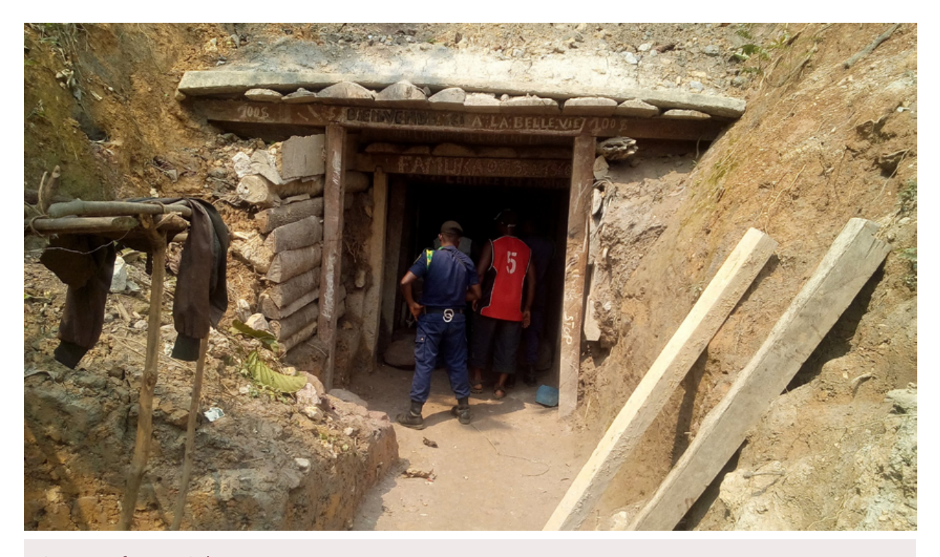
Presence of Mining Police in Kampene area, Maniema province

The state of siege "normalizes" the presence of FARDC in gold mines, as they are supposed to protect mines and artisanal miners against attacks and pillages by armed groups: this situation offers economic opportunities to Congolese army officers. The security situation did not improve during the state of siege. The civil society of North Kivu recently pointed out that during that period about 2,000 civilians have been killed, and that the armed group M23 has re-emerged.<sup>76</sup>