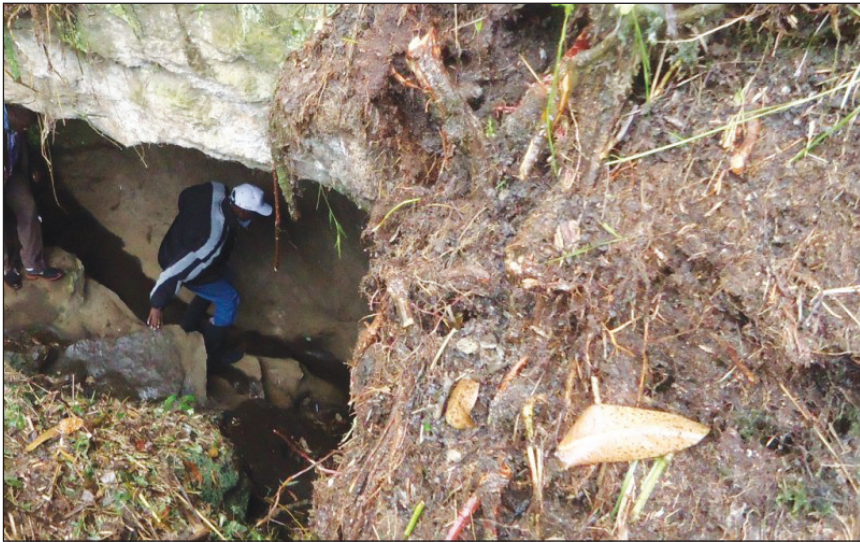
Ifoto y'Ubuvumo bwa Nyaruhonga bwiciwemo Abatutsi benshi kuva mu 1991 kugera muri Jenoside yakorewe Abatutsi mu 1994.

Ubuvumo bwa Nyaruhonga bwari buherereye muri Segiteri ya Mushumba ku musozi wa Nyaruhonga, ubu ni mu mudugudu wa Kamiro, Akagari ka Gasizi, Umurenge wa Mukamira.